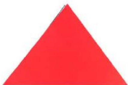
A-301E Red Orange