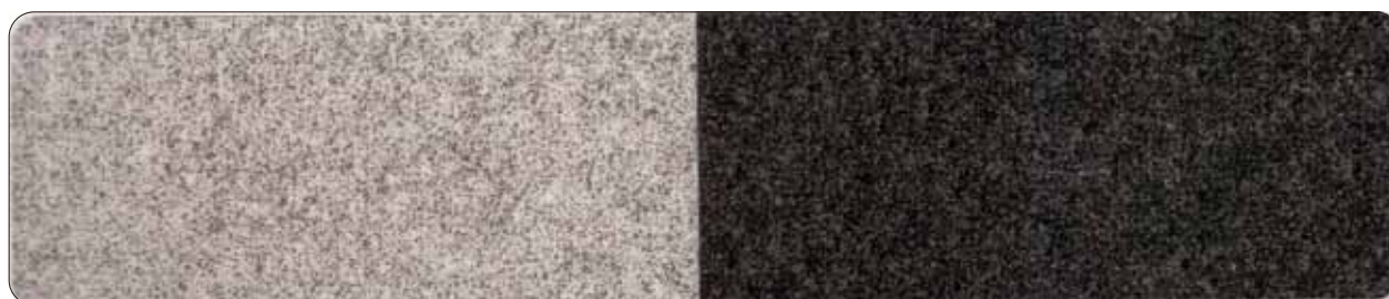
Glare® Ultra Nova Silver GL-9091H Size( \mu\text{m} ) 60 - 600