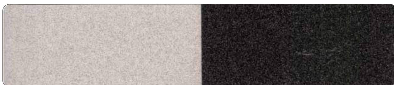
Glare® Super Nova Silver GL-9095G Size( \mu\text{m} ) 30 - 250