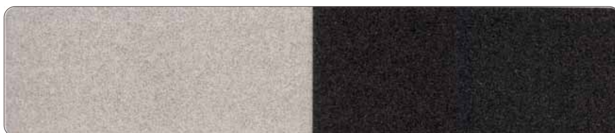
Glare® Crystal Nova Silver GL-9091P Size( \mu\text{m} ) 30 - 180