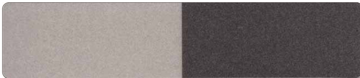
Glare® Shimmering Nova Silver GL-9091B Size( \mu\text{m} ) 15 - 90