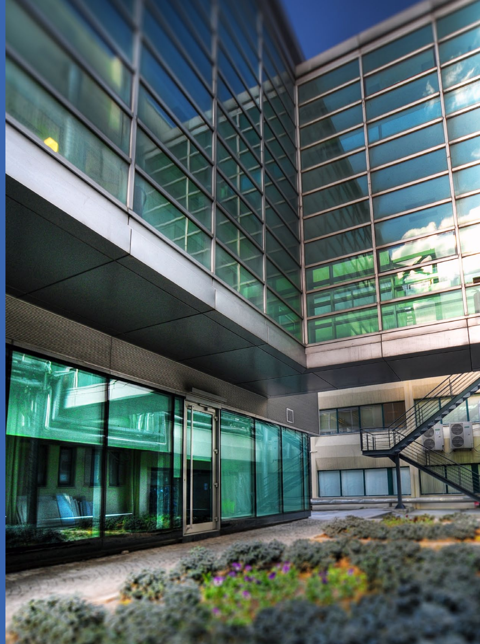
R&D Center, Istanbul

What we have accomplished so far is only a glimpse of what we will accomplish in the future.