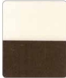
Automotive Natural™ Metallic Gold A-201S*-OP Size(μm) 9 - 40