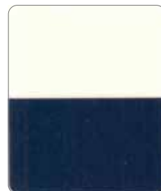
Automotive Natural™ Dazzling Blue A-581S*-OP Size(μm) 9 - 40