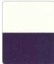
Automotive Natural™ Fine Violet A-561D-OP Size(μm) 5 - 25