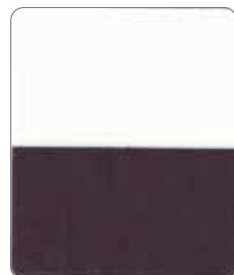
Automotive Natural™ Dazzling Red A-541S*-OP Size(μm) 9 - 40