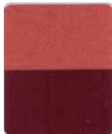
Automotive Natural™ Super Russet A-266S*-OP Size(μm) 9 - 40