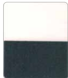
Automotive Natural™ Dazzling Green A-591S*-OP Size(μm) 9 - 40