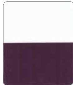
Automotive Natural™ Fine Red A-541D-OP Size(μm) 5 - 25