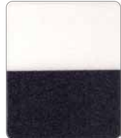
Automotive Natural™ Sparkle White A-801E-OP Size(μm) 18 - 100