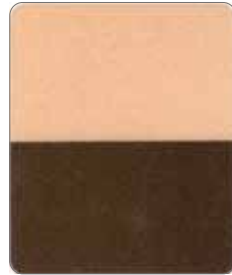
Automotive Natural™ Real Gold A-203S*-OP Size(μm) 9 - 40