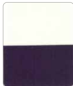
Automotive Natural™ Dazzling Violet A-561S*-OP Size(μm) 9 - 40