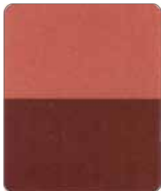
Automotive Natural™ Satin Copper A-240D-OP Size(μm) 5 - 25