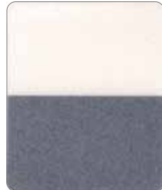
Automotive Natural™ Splendor White A-801K-OP Size(μm) 5 - 35