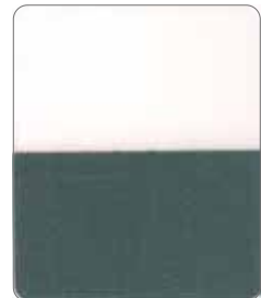
Automotive Natural™ Fine Green A-591D-OP Size(μm) 5 - 25