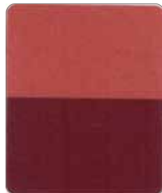
Automotive Natural™ Satin Russet A-260D-OP Size(μm) 5 - 25