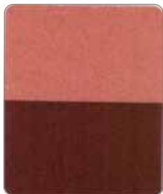
Automotive Natural™ Super Copper A-244S*-OP Size(μm) 9 - 40