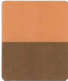
Automotive Natural™ Satin Gold A-201D-OP Size(μm) 5 - 25