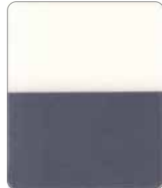
Automotive Natural™ Fine White A-801D-OP Size(μm) 5 - 25