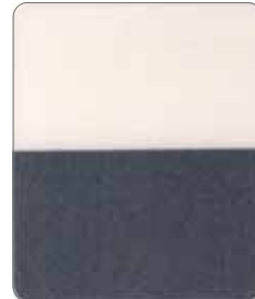
Automotive Natural™ Dazzling White A-801S*-OP,SP Size(μm) 9 - 40