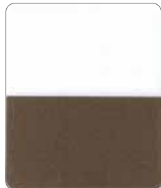
Automotive Natural™ Fine Gold A-501D-OP Size(μm) 5 - 25