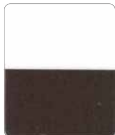
Automotive Natural™ Dazzling Gold A-501S*-OP Size(μm) 9 - 40